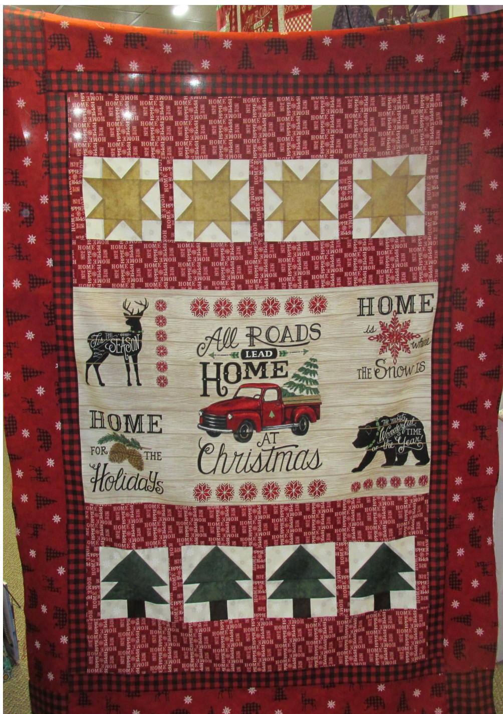
Moda Collection Holiday Lodge Quilt 56" x 76"